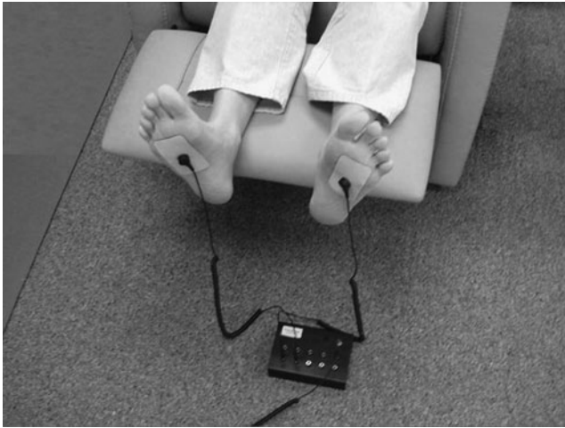
FIG. 1. Grounding system showing patches, wires, and box connecting to a ground rod planted outside through a switch (not shown) and a fuse (not shown). Similar patches and wires from the hands were also connected to the box to ground the hands.

For zeta potential calculations the Smoluchowski equation was used as follows 27 :